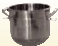
Vasca Bowl - Cuve Cubeta - Schüssel